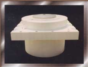
Rocket Launching Pad Stabilizer Cylinder

We are anxious to put our experience and know how to work for you, give us a call.